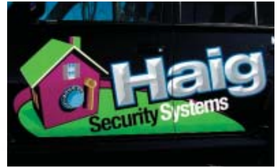
Retouched artwork of vehicle

out, took off the roof rack, license plate, inspection sticker, and dropped out the background. We then had a nice piece of art to be used for ads, brochures, Web sites and whatever else.