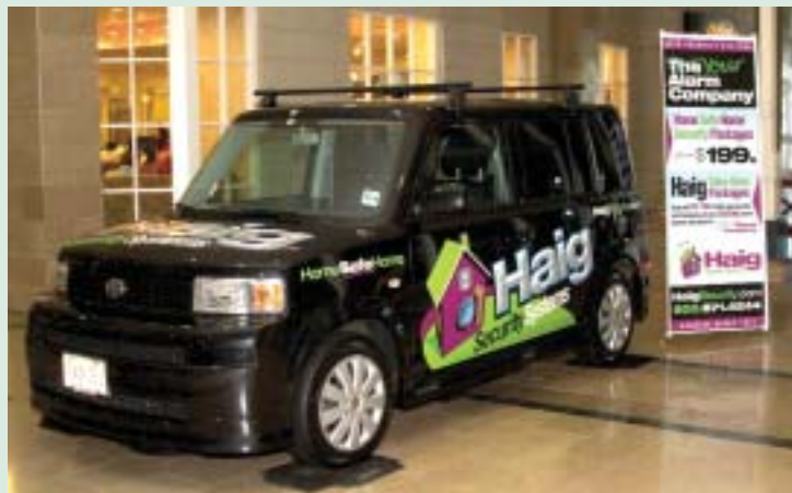
Here's the Scion inside a local mall, with complimentary POP displays that we designed and printed.